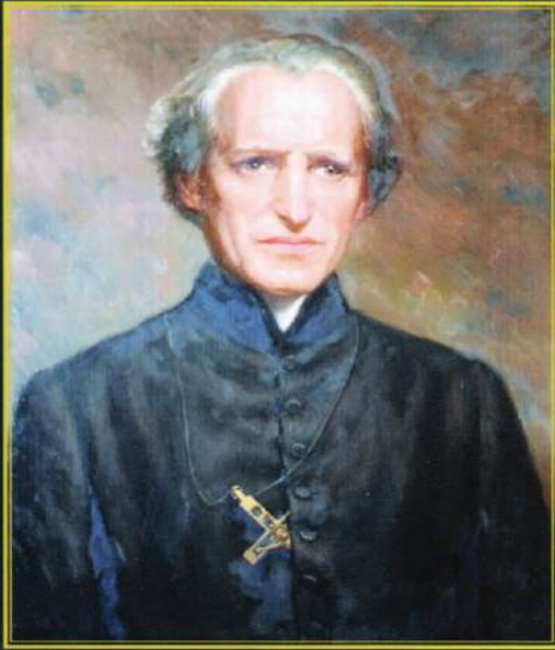
BLESSED BASILE-ANTOINE-MARIE Moreau